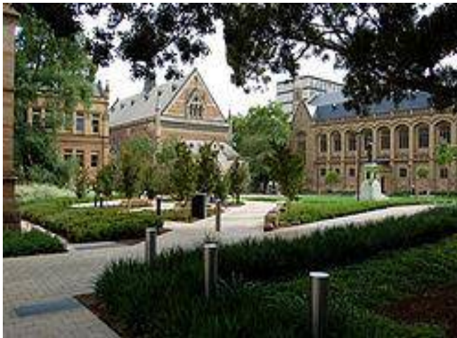
Landscaping Association of South Australia Award of Excellence 2007